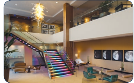
Our Lobby and Mezzanine are ideal for event registration, receptions and more.