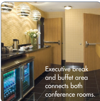
Executive break and buffet area connects both conference rooms.