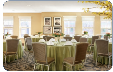
Apollo 11 is filled with stellar moon and astronaut photographs.

At the Moonrise Hotel we are excited to assist you in planning your perfectly tailored function. Lift off your meeting or event in one of our two stylish, modern rooms named for the first manned space voyage to orbit the moon, Apollo 8 , and the first to land a man on the moon, Apollo 11 . The surrounding mezzanine overlooking the striking modern lobby offers ample space for pre-event registration or gatherings. Our indoor/outdoor Rooftop New Moon Room offers dazzling views of the city skyline.