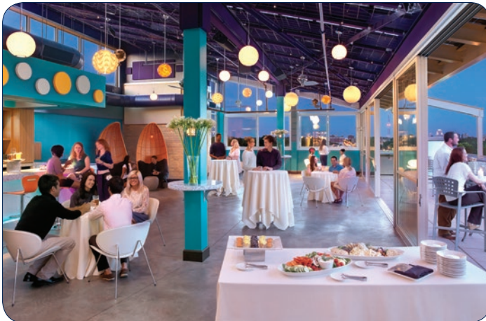
Rooftop New Moon Room