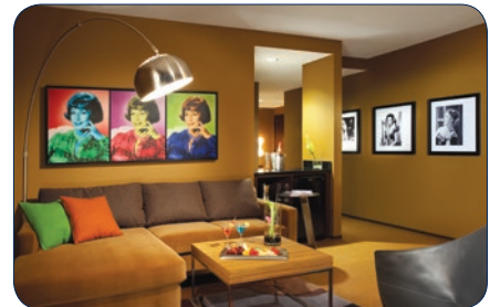
Our Walk of Fame Suites can host up to a 10-person meeting in the large common area.